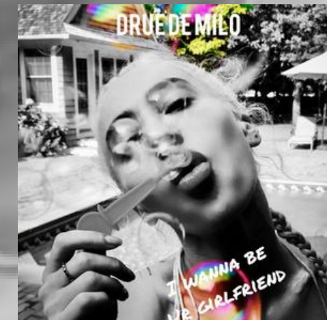
I Wanna Be Ur Girlfriend