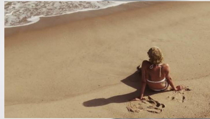
When I Fall in Love