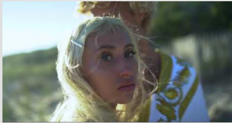
Drowning in Paradise