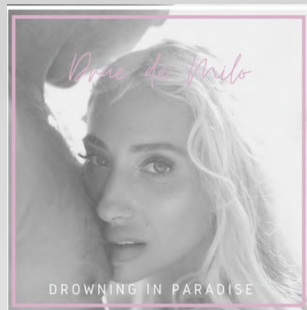
Drowning in Paradise