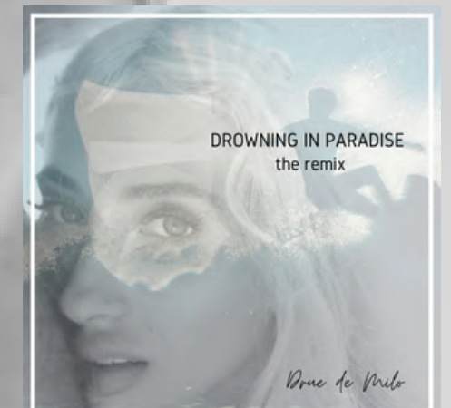
Drowning in Paradise - The Remix