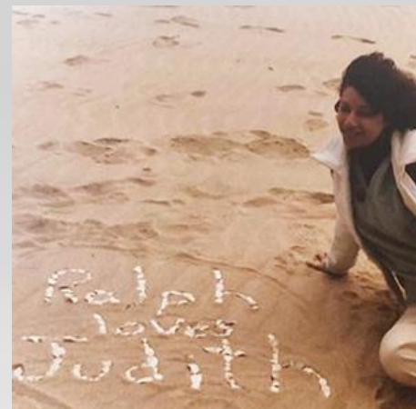
When I Fall in Love