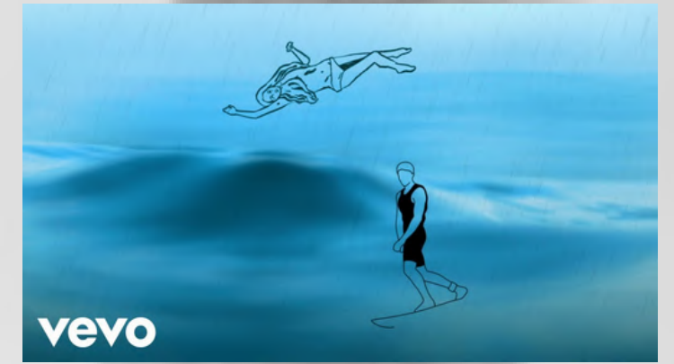
Drowning in Paradise - The Remix