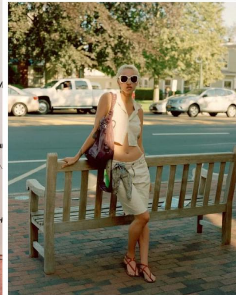
A scene from the Hamptons in East Hampton, New York, June 2019.

For some New Yorkers, there's only one place to spend the summer: on the East End of Long Island, in the spendy seaside enclave know to all as the Hamptons. The influx of out-of-towners typically hits peak in August, but the streets of hamlets like East Hampton are already hopping.